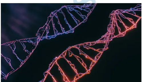
News Summary >> Next Page

Finding Genetics tough? To learn the basic teminology, scan the code