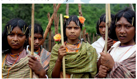
News Summary >> Next Page

To learn more about Tribals and Forest Rights, scan the code