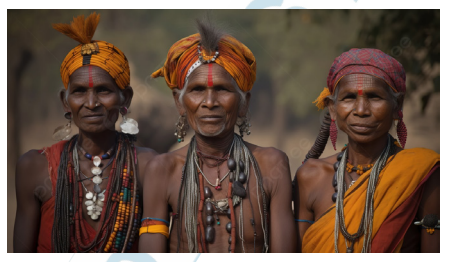
News Summary >> Next Page

To learn more about Budget & PVTG's welfare, scan the code